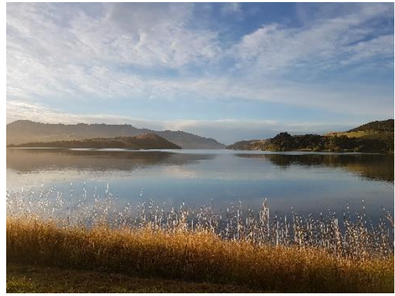
Barry's Bar view and the cheese factory stop

About Akaroa – Maori word (Long Harbour), 600 permanent residents, French influence, many businesses and streets have French names, numerous French Flags. French Government had decided to colonise what we now know as the South Island, and their plan was for Akaroa to be the main town and major Port of his new acquisition. A ship with 60 would be settlers aboard, set sail for Akaroa in early 1840, and arrived in August 1840, only to find that the Maori chiefs had signed a treaty with the British Crown at Waitangi near the top of the North Island, on 6 th February 1840, which annexed to whole of New Zealand as a British Colony.