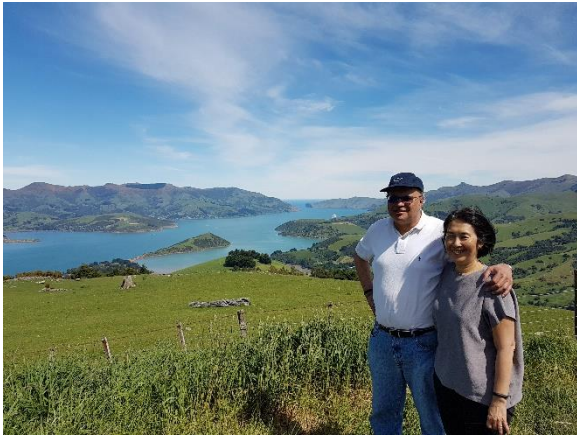
Hill top view